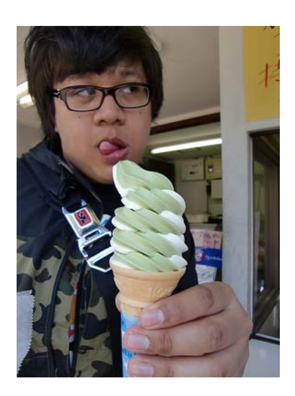
Sunday's Enoshima island. Up the hill is the shrine; there is a long line of people waiting to pray.